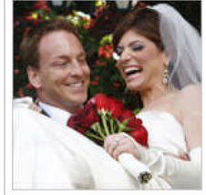
Weddings & Celebrations