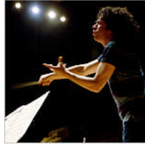
Gustavo Dudamel, Classical Populist