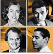
Attorneys at Politics: Would You Hire One?